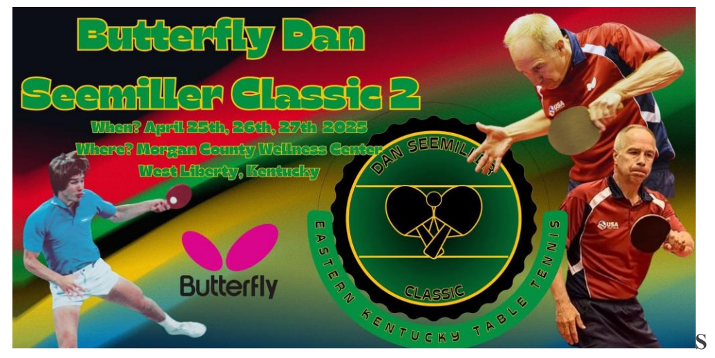
Submit entries online at www.omnipong.com