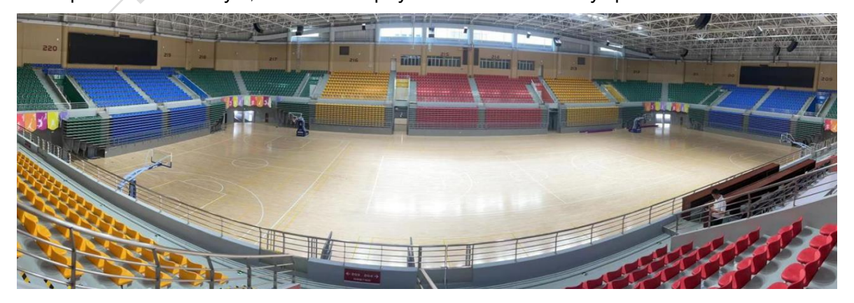
Suzhou University Sports Stadium