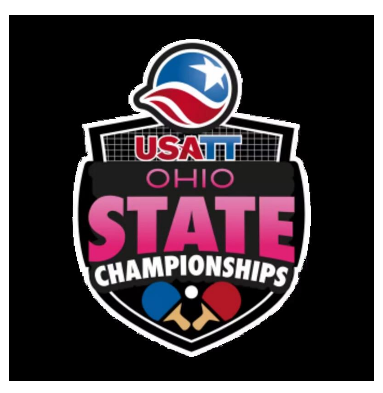
Sponsored by Great Exteriors Construction, Butterfly, Nittaku, Paddle Palace, USATT.